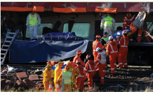
Figure 2 Extrication of victims from the sheared carriage