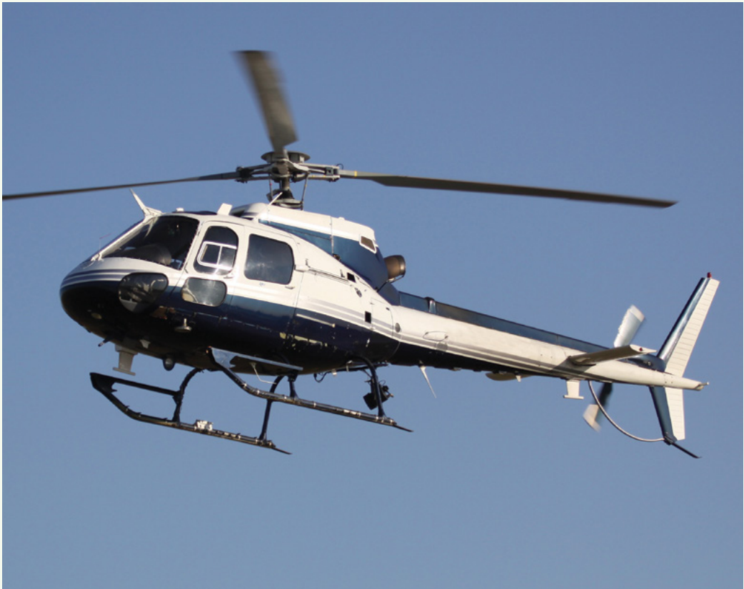
image: Eurocopter AS 350 B2

Also see page 14 of Resource booklet 9 Human information processing .