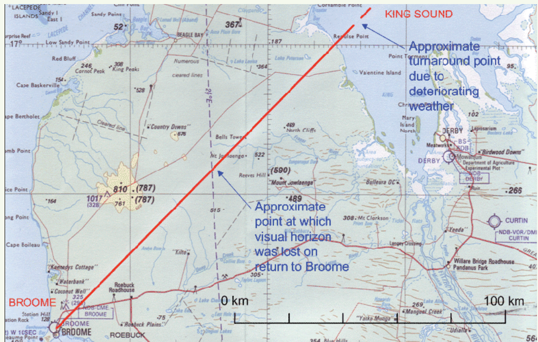
image: © ATSB | Aviation Occurrence Investigation report- AO-2007-014

Fortunately, the pilot was able to regain control of the aircraft and, shortly after, resumed the flight to Broome, which required the non-instrument rated pilot to descend through cloud before becoming visual and landing.