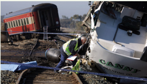
Figure 1 The truck which collided with the V/Line train at Kerang, Victoria

On 5 June 2007, at about 13:40 AEST, a northbound truck collided with a V/Line locomotive-hauled passenger train. Eleven people, including several children, were killed and many more were injured. The truck driver sustained serious injuries. Calculations revealed the estimated relative (closing) velocity was 150 kph, with the collision resulting in extensive damage to the truck and passenger cars, some of which were sheared open. The investigation concluded that the incident resulted from the driver of the truck not stopping at a level crossing at which active warning devices were operating. [6]