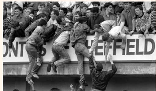
image: Liverpool fans trying to escape during the Hillsborough disaster at Hillsborough football stadium in Sheffield

Statement by the Police Match Commander at the Inquest [3]