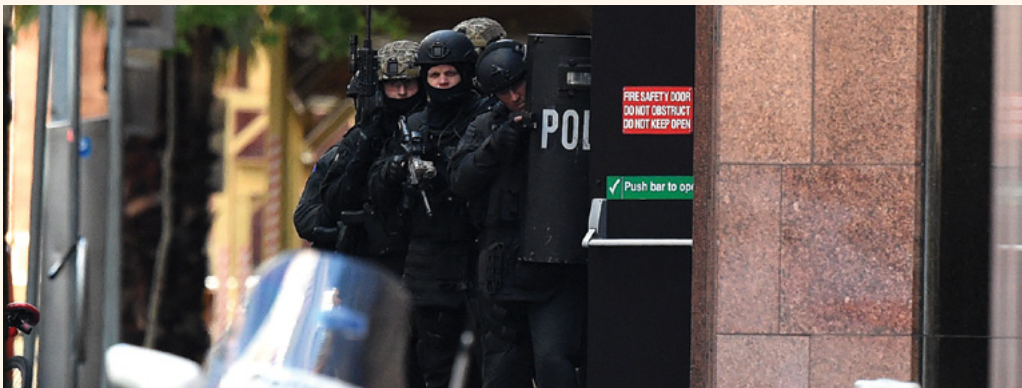
image: NSW Public Order and Riot Squad Police are seen on Phillip Street in the central business district of Sydney