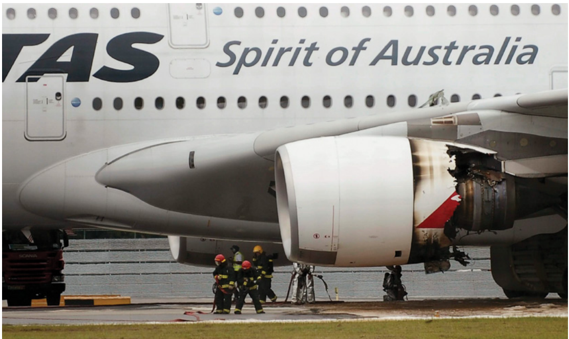
image: Significant structural damage to the number 2 engine

The extent of the damage and systems failure was unprecedented, and the incident could easily have led to a catastrophe. As CASA reported in a feature article in Flight Safety Australia (QF32 and the Black Swan):