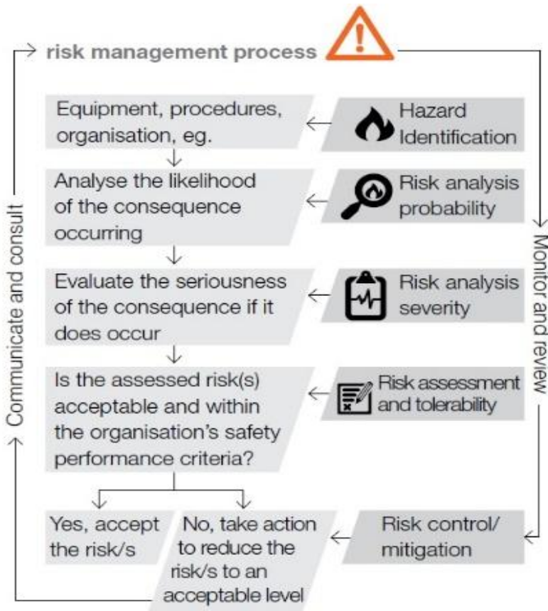
Figure 1: Risk assessment process

To assist with the conduct of the RA the operator has referenced the CASA SMS-3 booklet and has utilised the RA process outlined on page 5 of the booklet as reproduced below.